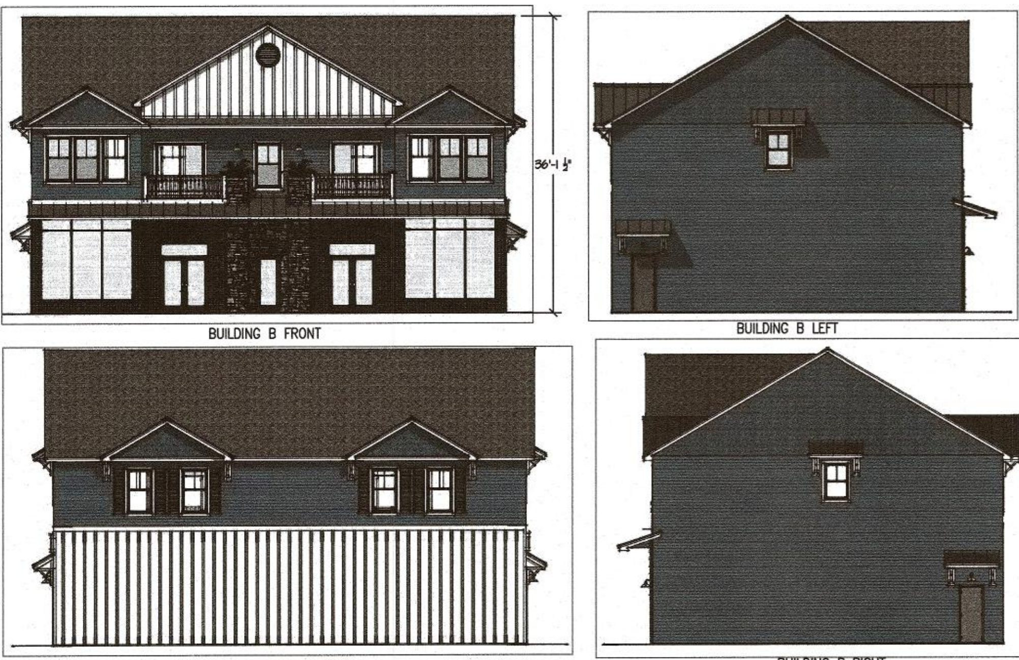
ARCHITECTURAL ELEVATION VIEWS SCALE: N.T.S.