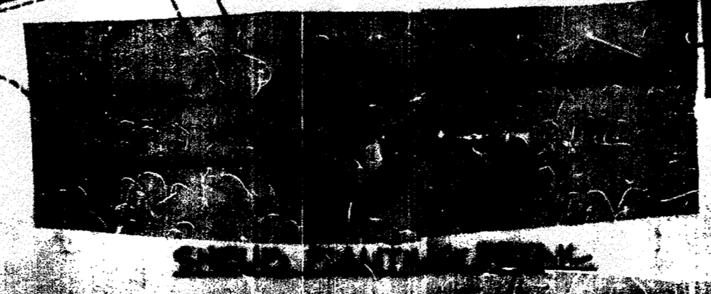
SEE SHEET 1 OF 4