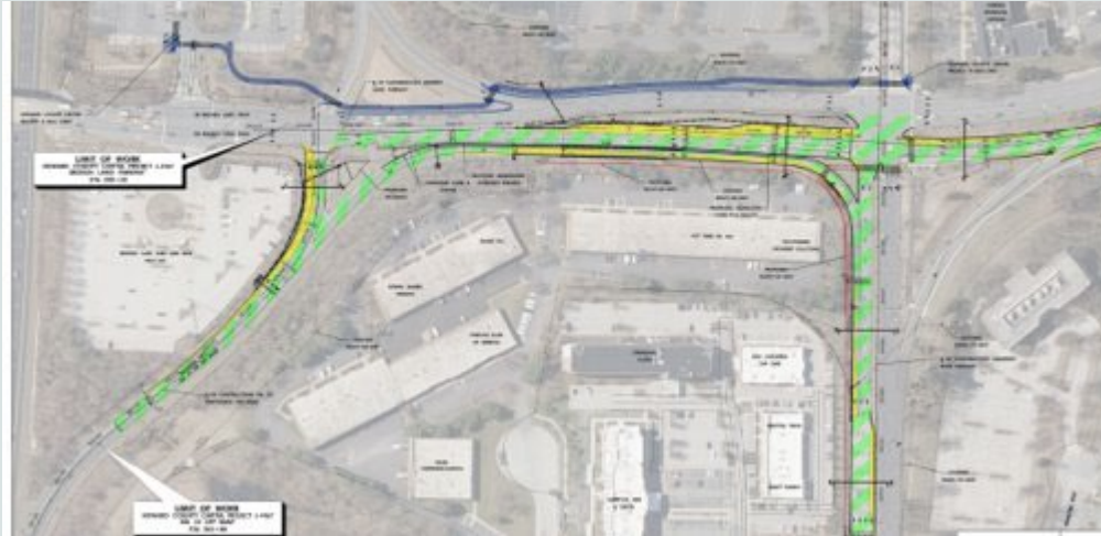
J4167 - Broken Land Pkwy/Snowden River Pkwy Intersection Improvements