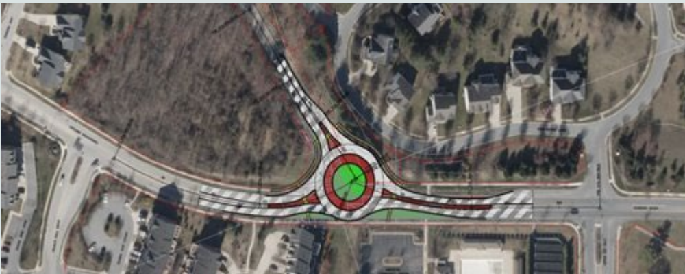
J4211 - Gorman Road/Skylark Blvd Roundabout