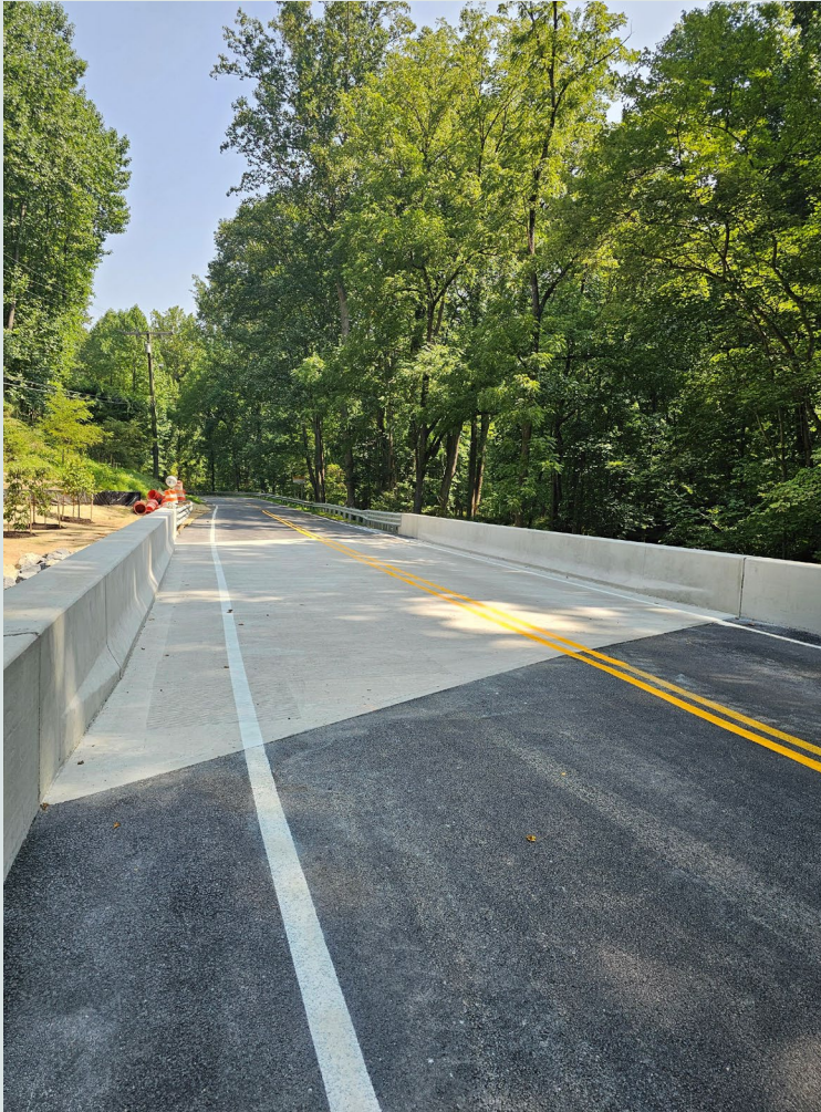
B3835 - Henryton Road Bridge Replacement Project – MDQI Award Recipient