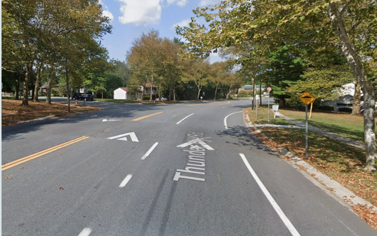
Thunder Hill Road (south of MD 175)