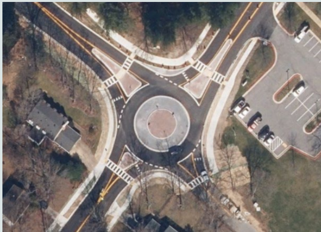
Old Montgomery Road at Tamar Drive Roundabout