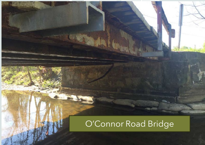
O'Connor Road Bridge