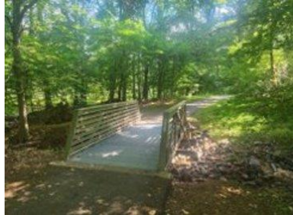
Woodland Road Bridge 3 Bridge Replacements