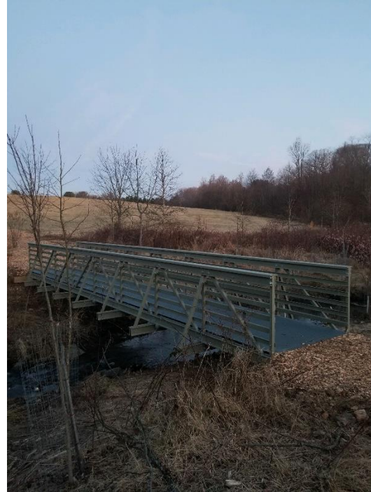
David Force Park Future Trail Bridge Concept