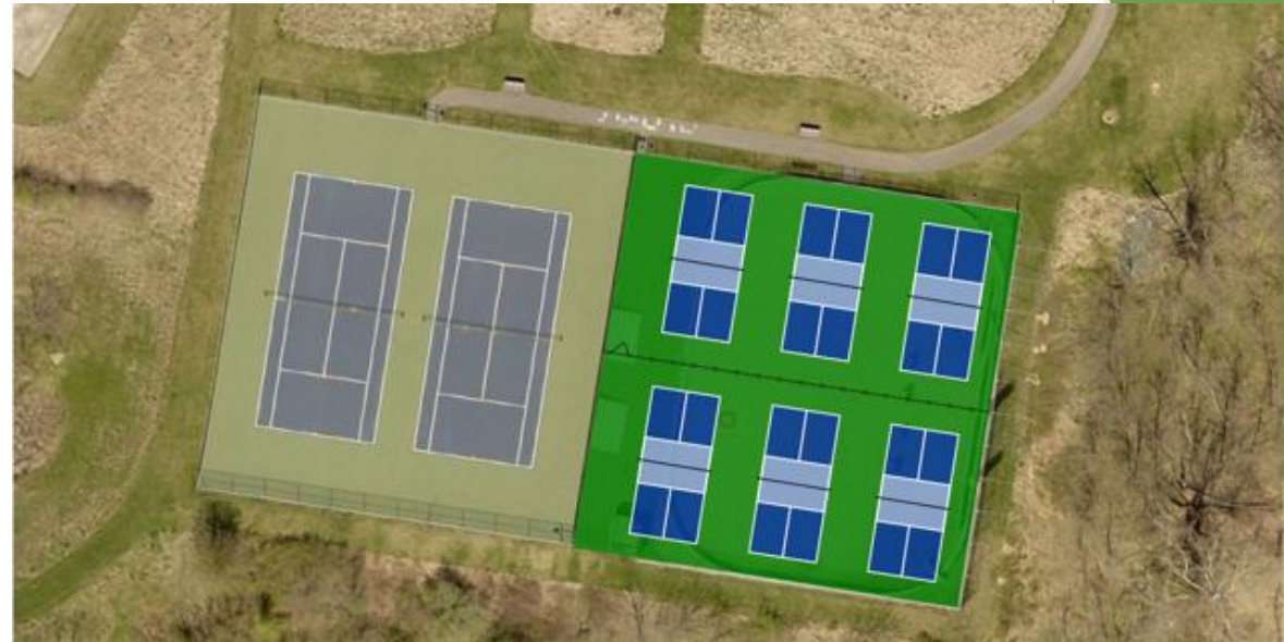
Alpha Ridge Park Pickleball Concept