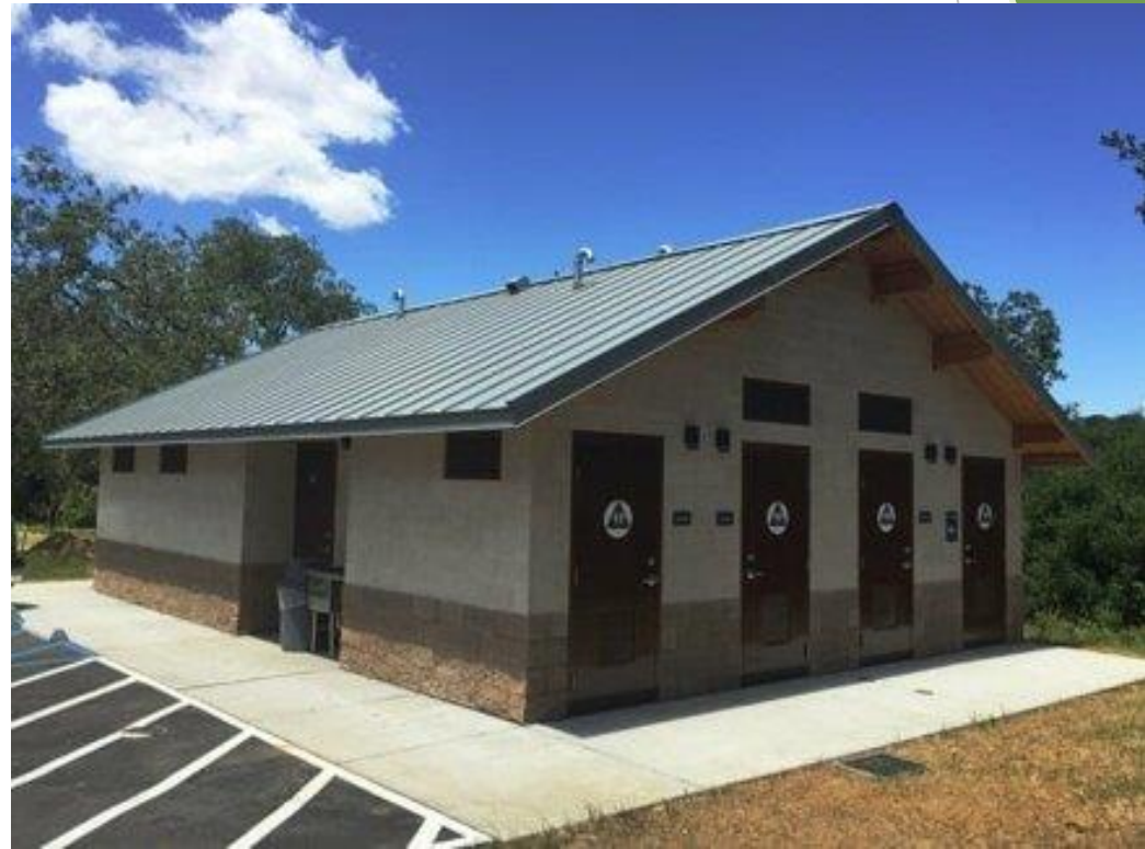
Restroom/Shower Facility Concept