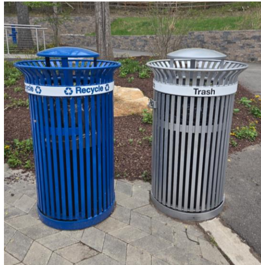
Recycling and Trash Bins