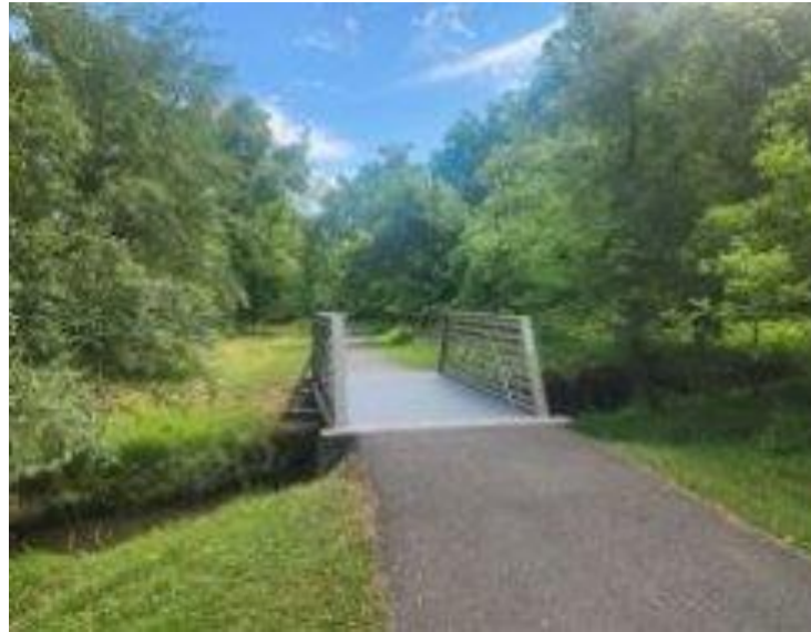
New Bridge & Path Connection (South)