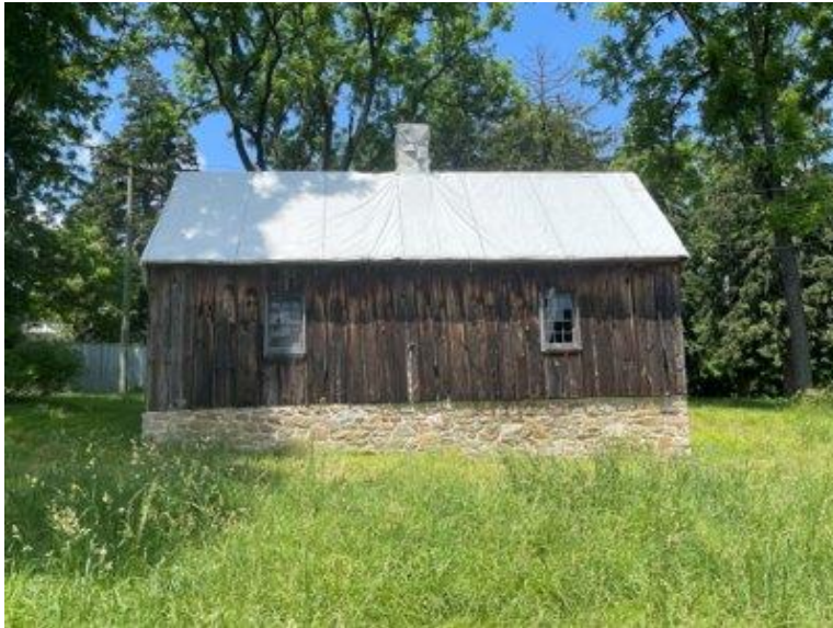
Blandair Slave Quarters