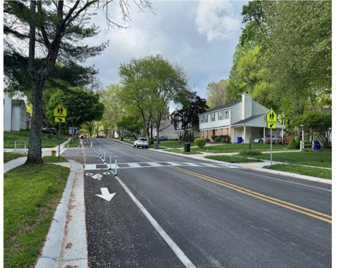
Flex post Intersection Radius Tightening – Phelps Luck Drive at Halflight Garth