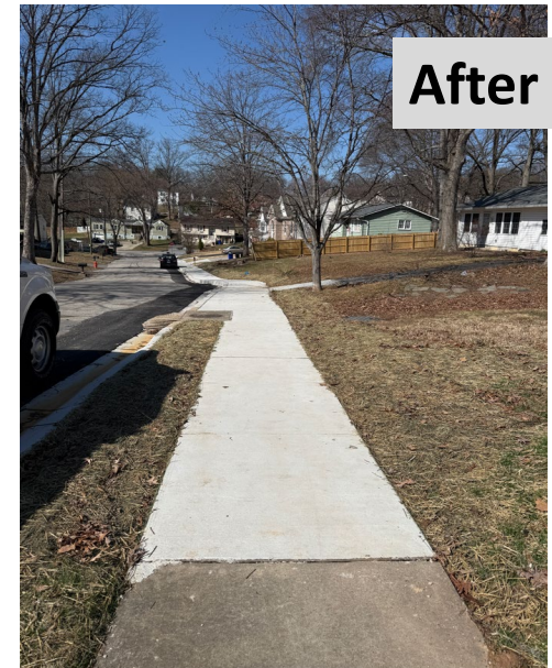
6 th St from Meredith Ave to Decatur Rd