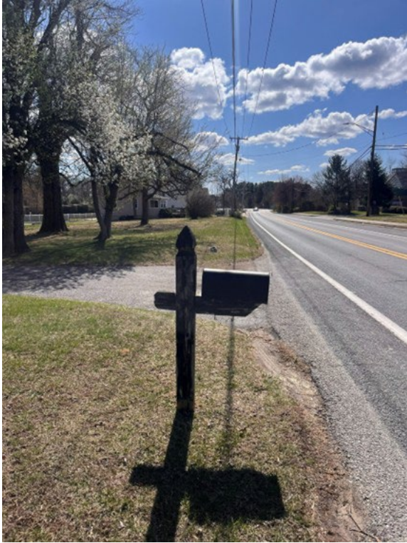
Harriet Tubman Lane