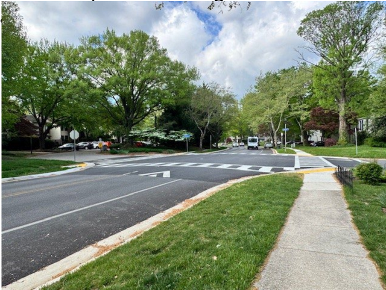
Raised Intersection – Phelps Luck Dr at Luckpenny Place