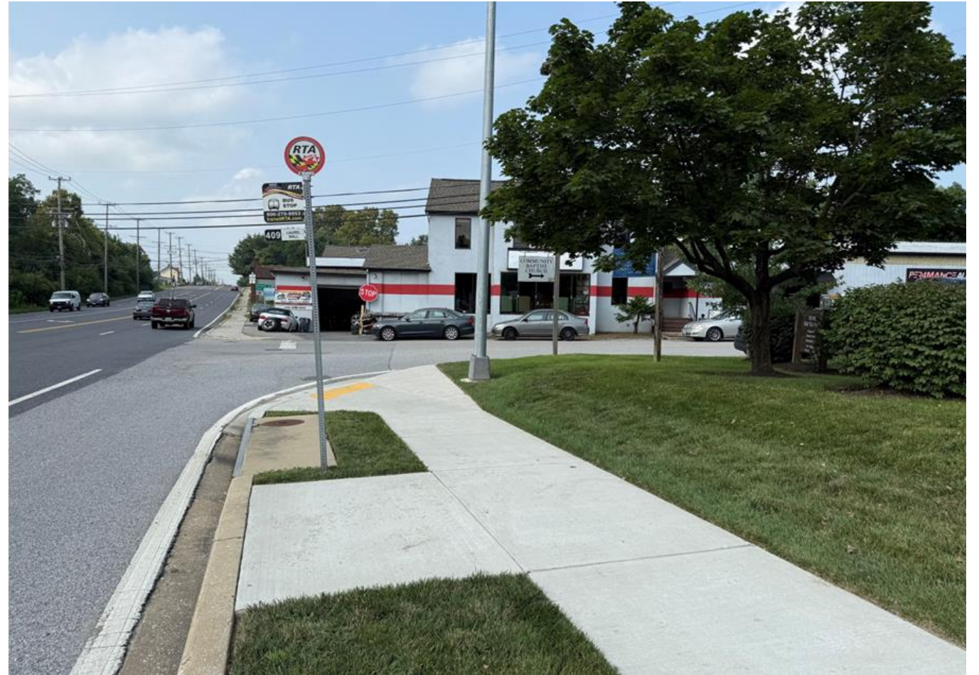
Washington Blvd (US 1) / Cedar Avenue